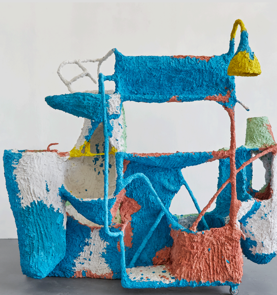
Image Credit: Olivia Bax, Off White, Sculpture. 2020. Image courtesy of the Artist and Holtermann Fine

During the exhibition, several works that are present at the beginning of the project will disappear and be replaced with new sculptures, to create different interactions and connections.