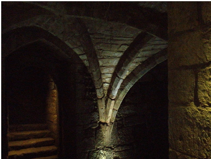
Picture taken within the Medieval Undercroft showing the vaulted ceiling and the now blocked off east staircase.

When in the cellar, it is possible to see that there were once two separate entrances, one of which (the east stairs) is now blocked. In addition, it can be seen that windows (now also blocked off) were constructed, indicating that topography of the land once allowed for the room to be lit.