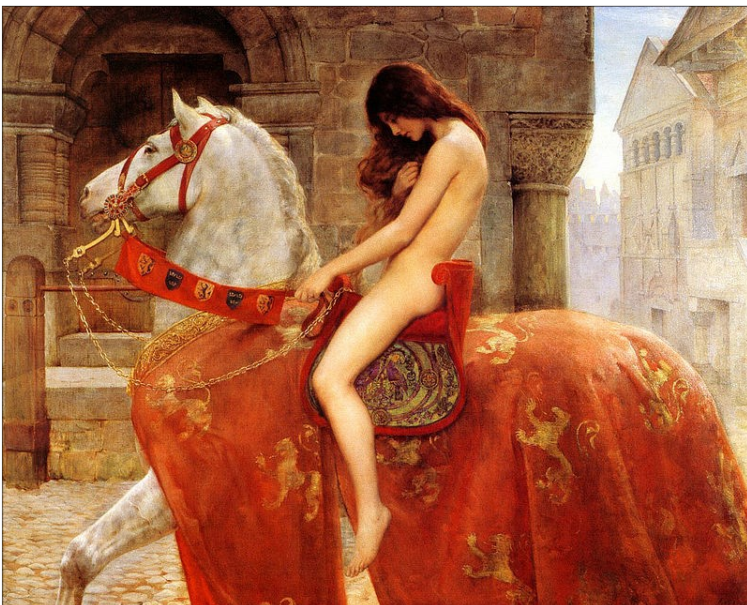
Lady Godiva by John Collier, c. 1897,

The annual Trinity Street Fair, now known as the Lady Godiva procession, would have passed down Bayley Lane annually, namely due to its proximity to the cathedral.