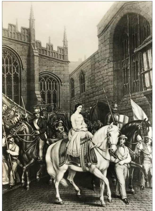
The Godiva Procession, Bayley Lane, Coventry by David Gee (1867)

Dating from the late 13th century, the legend of Lady Godiva's nude procession first became celebrated in the late 17th century, and is depicted in numerous artworks from the 18th and 19th centuries.