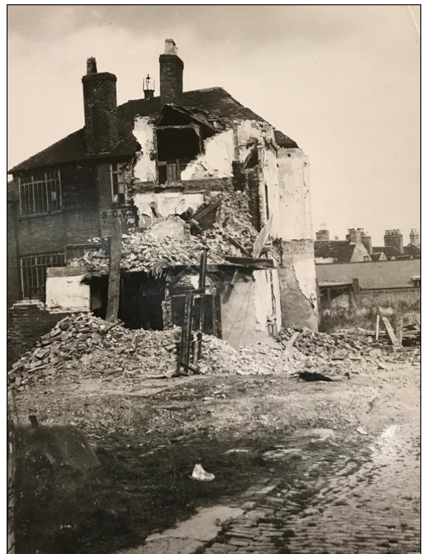
Image depicting the damage caused to 38-39 Bayley Lane.

Oral testimonies from those who lived through the Blitz depict not only scenes of terror, but of humanity and solidarity between neighbours, friends, and even strangers. The residents of Bayley Lane would have taken solace within their nearby air raid shelter, likely that of St Mary's Guildhall.